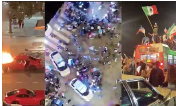
Video grabs show some scenes from the 2022 Mexican Independence Day celebration in the Loop.

Foxtrot was an upscale convenience store and cafe, founded in Chicago in 2015 with their first store located in Fulton Market District. They had 15 Chicago Foxtrot locations in the areas of Lincoln Park, West Loop, Wicker Park, East Lakeview, River North, Southport, Old Town, Gold Coast, Fulton Market, Streeterville, Tribune Tower, Willis Tower, Wrigley Field, Hubbard St., and Milwaukee and Damen avenues.