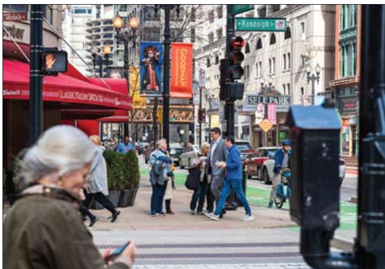
Pedestrians at State and Randolph in the Chicago Loop.

In its quarterly State of the Loop report, CLA says State St. in the first quarter of 2024 aver-