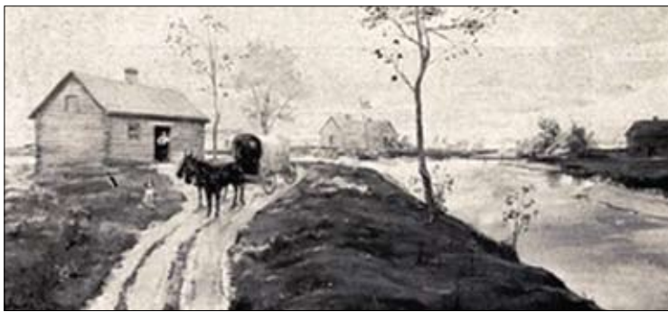
Chicago's very first U.S. Post Office, 1833.

ago's mail over the years, it is possible to see how Chicago became connected with the rest of the country.